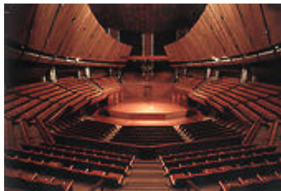
Michael Fowler Centre in Wellington

Although many details of the tour remain to be worked out, the outline is already becoming clear: 4 or 5 concerts in the best venues in the country, collaborations with young New Zealand musicians, sightseeing and other exciting activities as the orchestra travels from Auckland, Rotorua, and Wellington on the North Island to Christchurch on the South Island before returning home. If CYS' past 18 tours are any indication, the New Zealand tour will be musically and educationally fulfilling -- and a lot of fun.