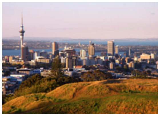
The beautiful coastal city of Auckland