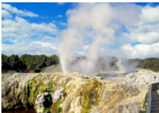
Spectacular geysers of Rotorua