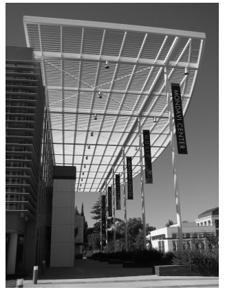
Mondavi Center for the Arts