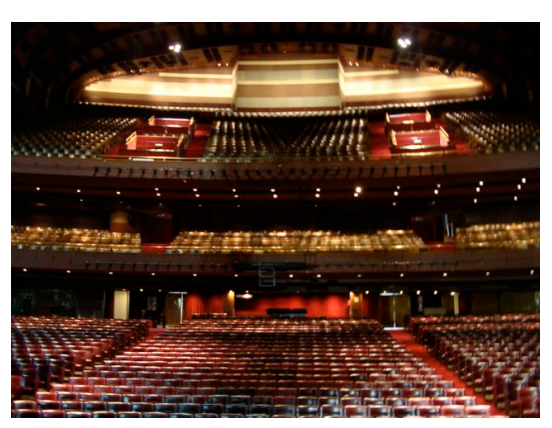
Gran Rex Theater, Buenos Aires