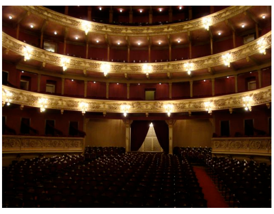
Teatro El Circulo, Rosario, Argentina