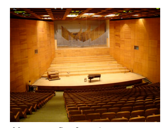
Mozarteum, San Juan, Argentina