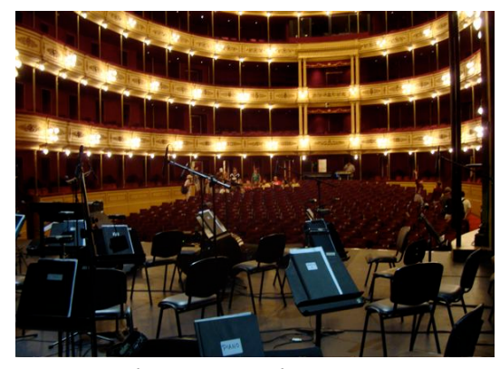
Teatro Solis, Montevideo, Uruguay